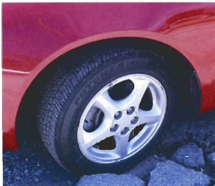
Drive slowly through potholes to prevent tire damage.

Watch for potholes and avoid hitting them whenever possible. Drive carefully around or straddle a pothole. Stay in your own lane and check front zones as you try to avoid potholes in the roadway.