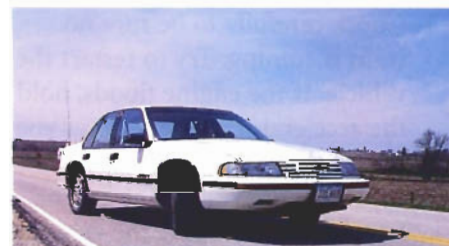
Countersteer when the front tire reaches the roadway.