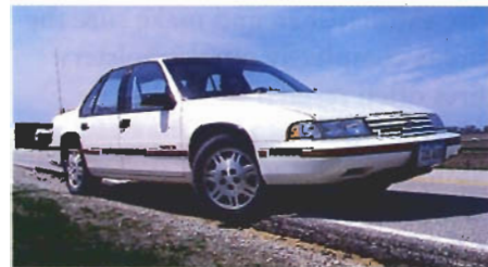
Turn sharply to get back on the pavement.