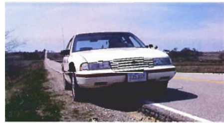
Straddle the roadway edge.