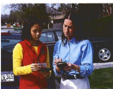
Exchange information with all drivers involved in a collision.

3. Prevent Further Damage. Warn oncoming traffic with flares or reflectors placed at least 100 feet ahead of and behind the collision site (500 feet away in high-speed traffic). If you do not have such devices, another person might stand in advance of the site and direct vehicles around the collision. Do not put yourself or others in danger while directing traffic.