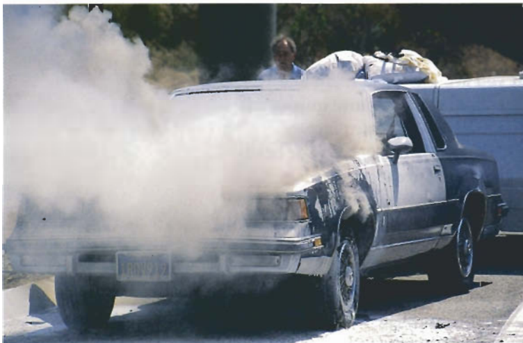
Do not open the hood if smoke is coming from under it.

Fire is possible in any collision where the engine compartment is smashed. Turn off the ignition, and